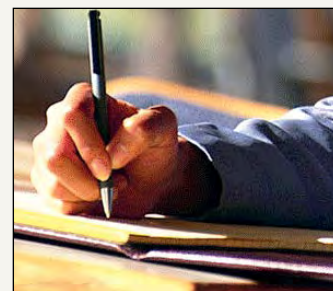
Send a letter