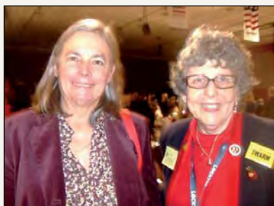
Make a visit